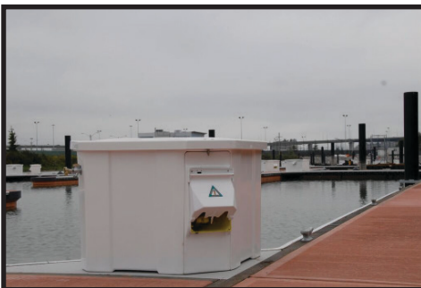
Bayside Mounted in Dock Box