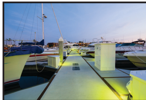
Bayside Pedestal Option