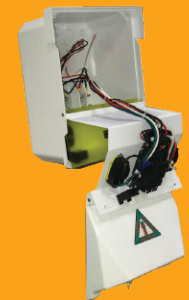
Pivoting Faceplate Assembly