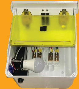
Easy-Access Terminal Block and Light Assembly