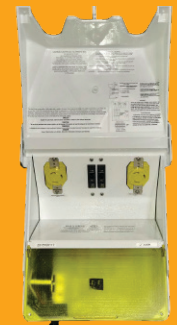
Weatherproof Receptacle & Breaker