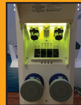
Extra-Wide Back-Lit Receptacle Faceplate