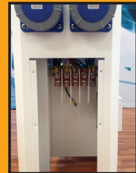
Easy-Access Terminal Block