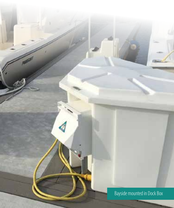
Bayside mounted in Dock Box