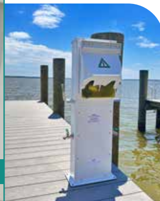
Bayside Pedestal option