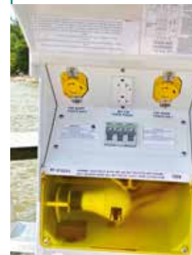
Extra-Wide Receptacle Faceplate Cover