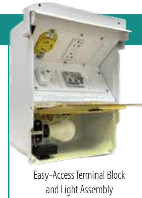
Easy-Access Terminal Block and Light Assembly