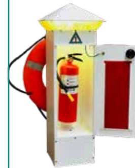
Fire Station 10 or 20-lb. Extinguisher Option