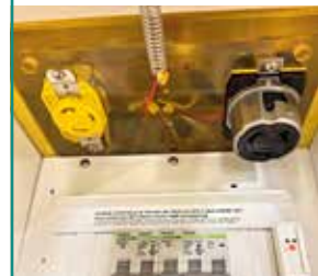
Extra-Wide Back-Lit Receptacle Faceplate