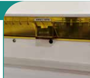
Protected kWh Counter