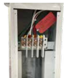
Easy-Access Terminal Block