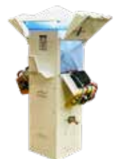
Pivoting Faceplate Assembly