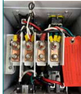
Easy-Access Terminal Block