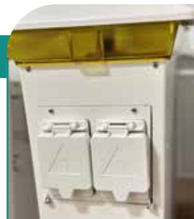
Weatherproof Receptacle & Breaker Covers